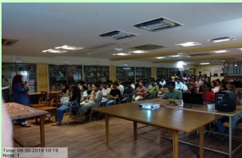
Commerce department organized The Poster Competition on Thursday 16 th September 2019