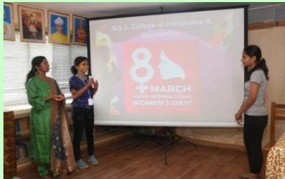
WDC organized Women's Day on 8 th March 2020