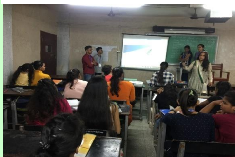
Presentation competition organized by Mathematics on National Mathematics Day 15th