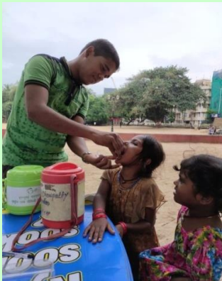
Pulse Polio Campaign by NSS