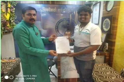
Chinchpokli Swachhta Abhiyan Appreciation