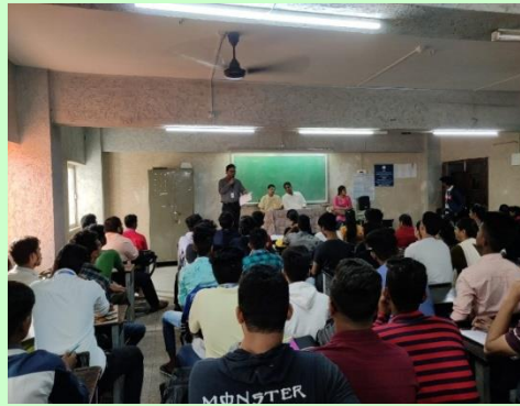
Department of Accountancy organized Guidance lecture on "Career in Accountancy and Taxation" on 8 th Feb.,2020.