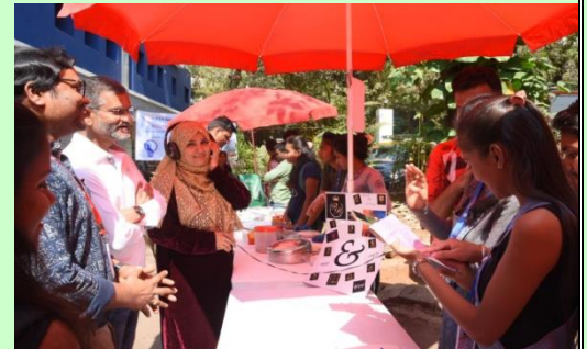
BUSINESS FIESTA 2019-20 was organized by EDC and Commerce department on 15/02/2020.