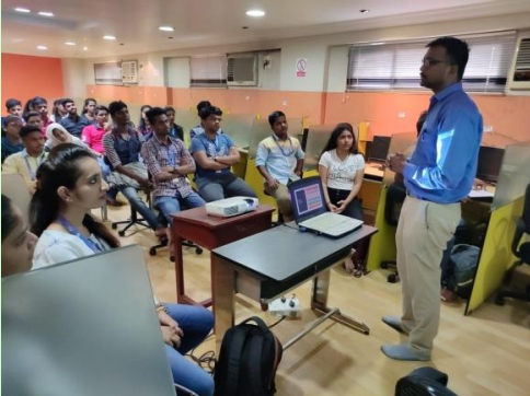
Certificate course in Tally ERP and Introduction to GST ( 3 months ) in association with ICA, Bangalore