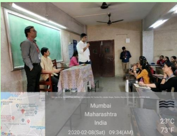
The Guidance lecture on “Career in Accountancy and Taxation” in association with Department of Accountancy 8 th Feb.,2020