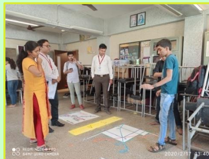
The Rangoli Competition was organized by the department of Economics on 17th February, 2020