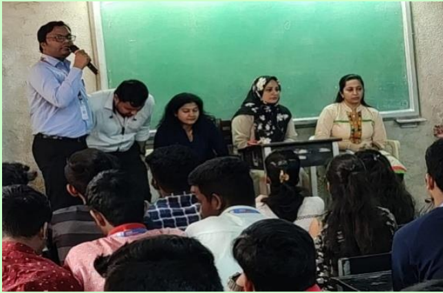
Guidance lecture on “Career guidance on UPSC/MPSC Examinations” in association with Pravaah Institute, Bandra Mumbai after Graduation on 22 nd Jan.2020