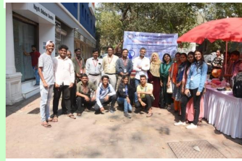
EDC had organized An event called BUSINESS Fiestas - Trade fair at NSS College of Commerce and Economics on 15/02/2020.