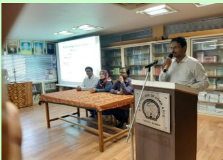
Marathi Vangmay Mandal, Dept of Business Communication and Library Dept. organized Reading Week in the first week of March 2019