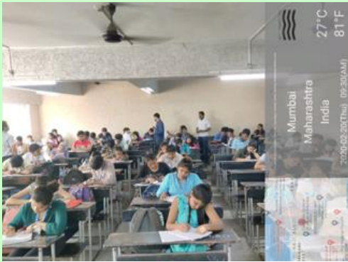
Common Proficiency Test (CPT) in Accountancy on 20 th Feb.,2020