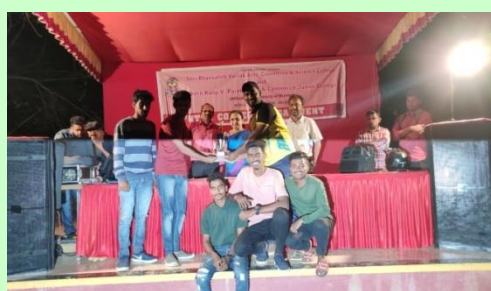
Our Box Cricket team won many prizes