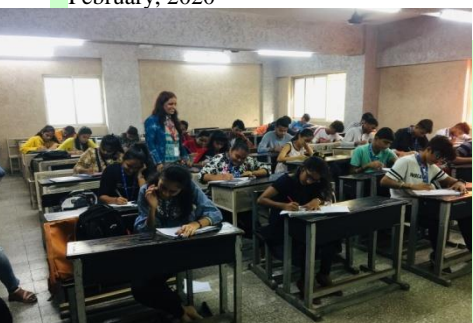
Mathematics department Organized Essay Writing competition on National Mathematics Day 24th Dec