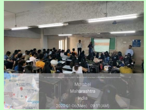
Department of Accountancy organized Guidance lecture on "Tally ERP and GST and Resume writing" is organized on 6 th Jan.,2020