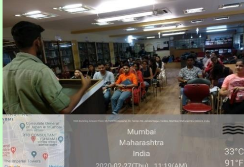
MARATHI VANGMAY MANDAL CELEBRATED MARATHI PANDHARWADA