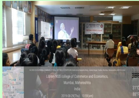
Organized live Speech of honorable Prime Minister of India Dr. Narendra Modi