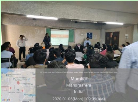
The "Guidance lecture on "Tally ERP and GST and Resume writing " is organized on 6 th Jan.,2020