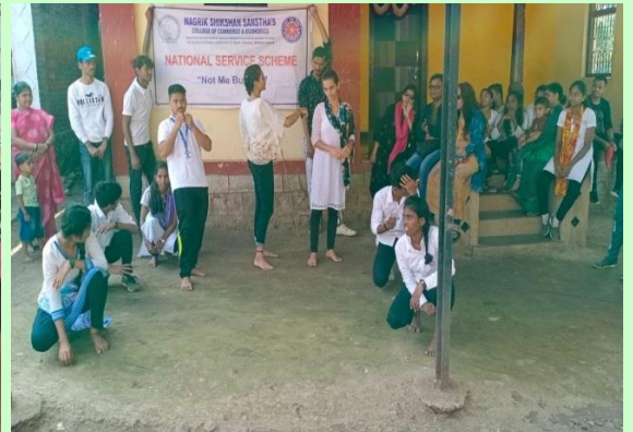
Street play by NSS volunteers