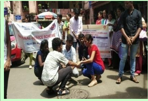
Our NSS unit performs Street Plays to create social awareness