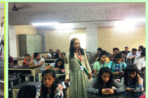
Online Quiz competition was organized by Mathematics on 23rd Dec 2019 National