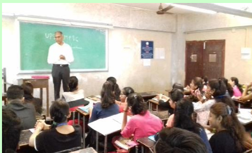
Coaching for Entry in Centre/ State Civil Services and Bank recruitment.