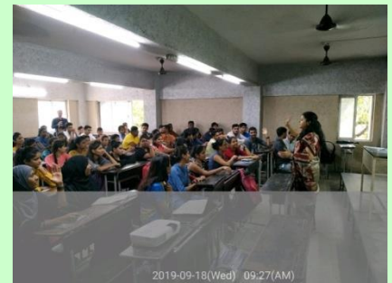
Remedial teaching lecture series was arranged for the students before exam in the month of February - March