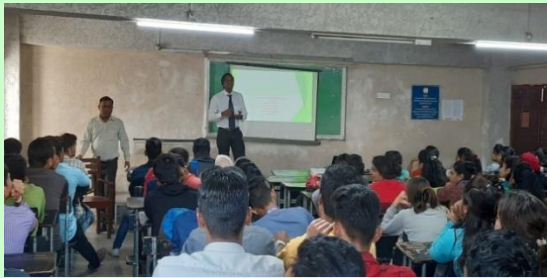
The Guidance lecture on "Networking and Hardware Industry and opportunities" in association with Jetking Mumbai on 17 th Jan.,2020