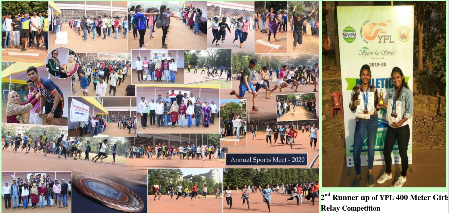
2 nd Runner up of YPL 400 Meter Girls Relay Competition