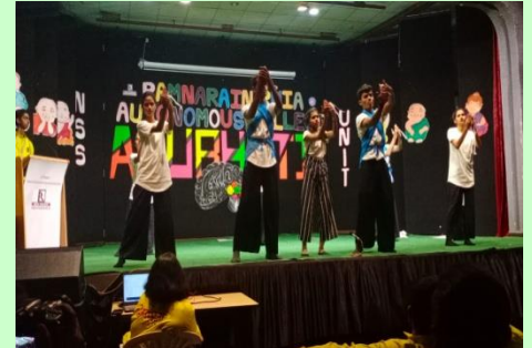
Anubhuti- Ruia College