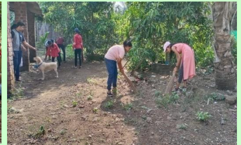
NSS Camp at Adopted Village Parol village