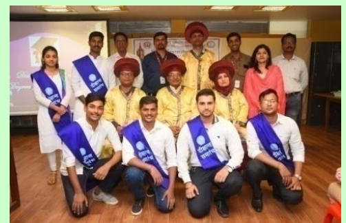
CONVOCAION CEREMONY on 25 th of January, 2020