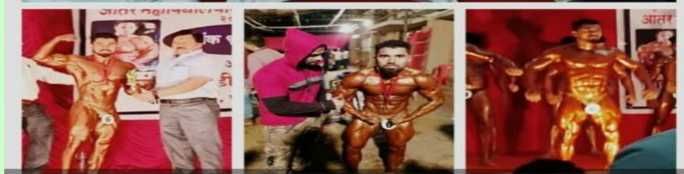
Our winners in Body Building Competition