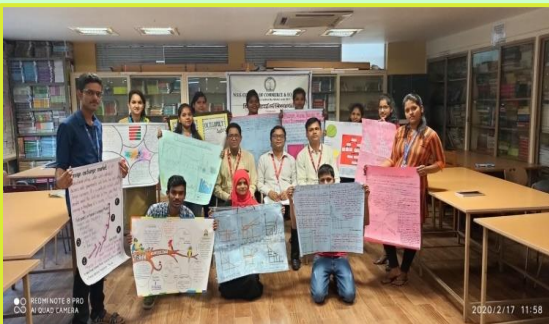
The Poster making Competition was organized by the department of Economics on 17th February, 2020