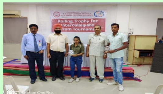
1 st Position in Carrom Tournament KES college Alumni Rolling Trophy 2019-2020 organised by KES College held on 12 & 13 Dec.2019