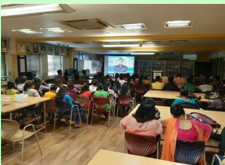
Live streaming on Union Budget from Loksabha on 18 February 2020 by the department of Economics and Library