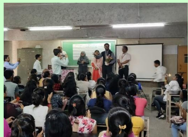
The Guidance lecture on Guidance lecture on “Career in options in network marketing “ 2 nd Dec., 2019