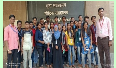
Visit to RBI Monetary Museum was arranged by the department of Economics on 05.02.2020.