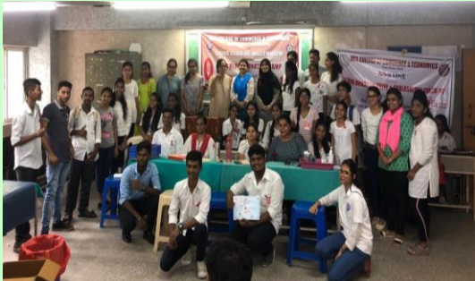
Blood donation drive by NSS Cell