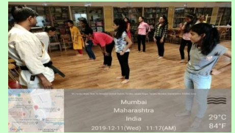
WDC Organized Self defense workshop for female students