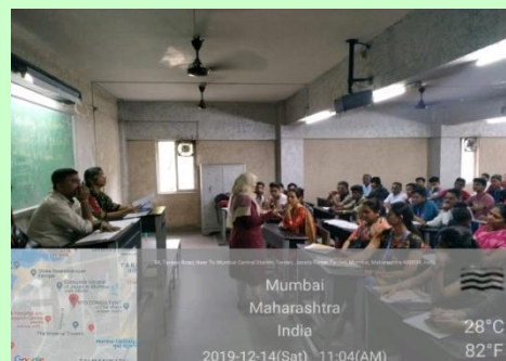
Meeting with the parents and Parents-Teacher committee was organized on 14.12.2019 in the college.