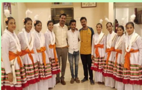
Folk Dance Group- Consolation Prize at youth Festival 2019-2020