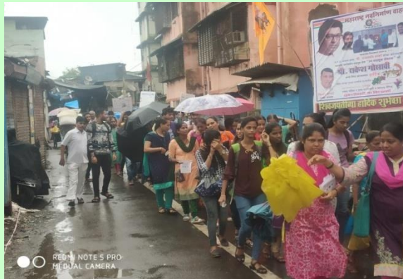
Dengue Malaria Rally by NSS Volunteers