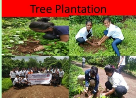
Tree Plantation by NSS