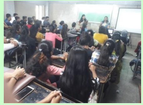
The Guidance lecture on " Communication and Employability Skill for students "for Placement Training programme were organized on 17 th Sept.,2019