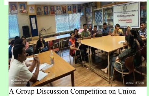
A Group Discussion Competition on Union Budget 2020 -21 was organized by the Department of Economics on 18 th February 2020