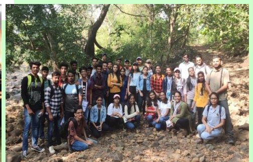
EVS department organized Shilonda Trail at National Park, Borivali on 18 th December 2019.